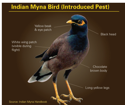
The Indian Myna.

Anyone who would like to assist is welcome with all efforts greatly appreciated. For more information please call SNELCC on 6772 9123 or email mail@snelcc.org.au .