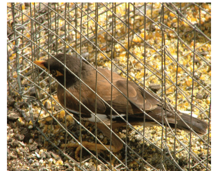
SNELCC has Indian Myna traps available for use by community members.