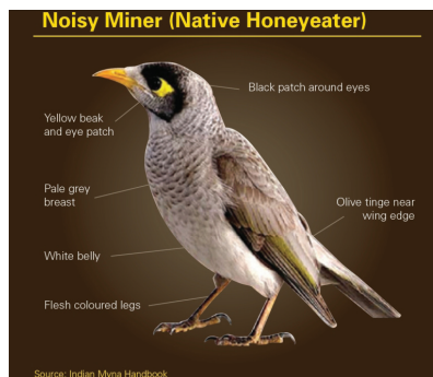
The native honey-eating Noisy Miner.