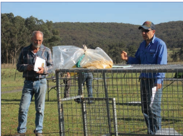
Discussing baits for pigs