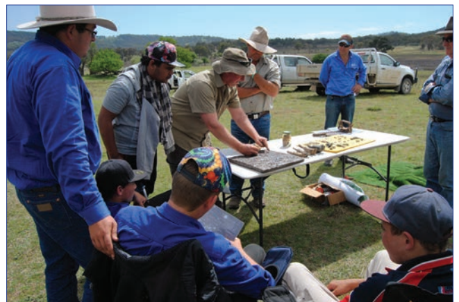
Discussing different tracks