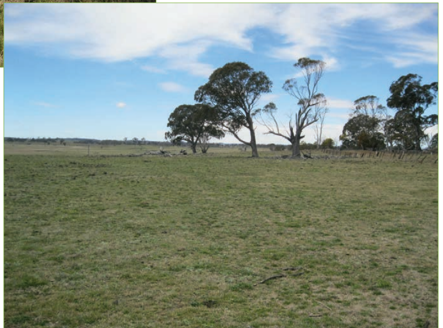
Native trees and shrubs at this site will replace aging trees and link small remnants