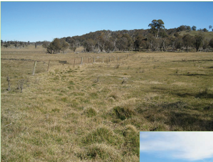
A tree corridor from here will link across basalt country to existing wooded areas

Approaches to ‘On-farm Native Vegetation Management’ will be the subject of two field events in November. The first event will be on Friday 21st November at “Eastlake”, via Uralla; and the second day will be at “Olmo”, Boorolong on Tuesday 25th November.